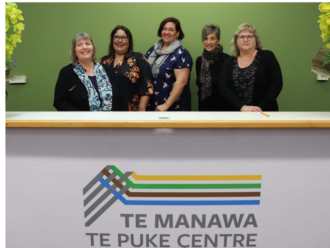
FIVE OF THE TEAM